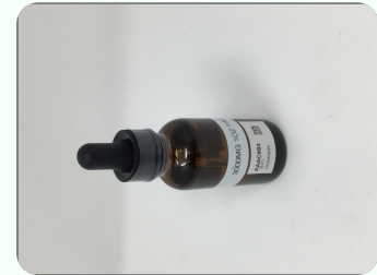
The photos on this report are of a sample collected by the lab and may vary from the final packaging.

Potency Tested Residual Solvents Passed Pesticides Passed